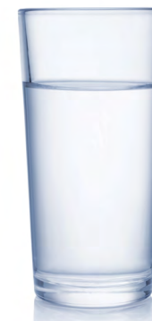
Water or 0-Calorie Drinks

This plate features cooked greens, cooked summer squash, roasted sweet potato, and baked chicken.