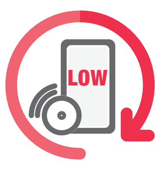
Frequent low blood glucose