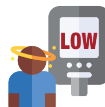
Recognition and Treatment of Hypoglycemia