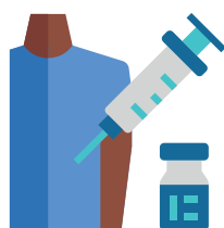
Proper Injection Technique

Your healthcare provider will educate you on appropriate insulin use.